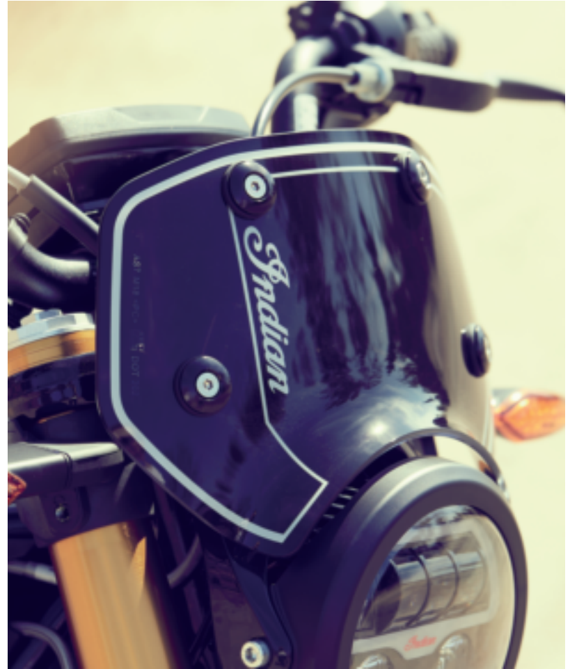
Professional rider. Closed course. Do not attempt. North American models shown with optional accessories.